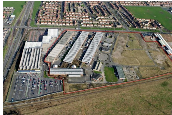
188 new homes providing a broad mix of family housing

Northern Trust Company Limited is proposing the large scale mixed use regeneration of the West Chirton (South) Industrial Estate. The illustrative layout shows the manner in which the existing derelict land and buildings can be brought back into beneficial use providing a mix of new accommodation for both businesses and families in the area.