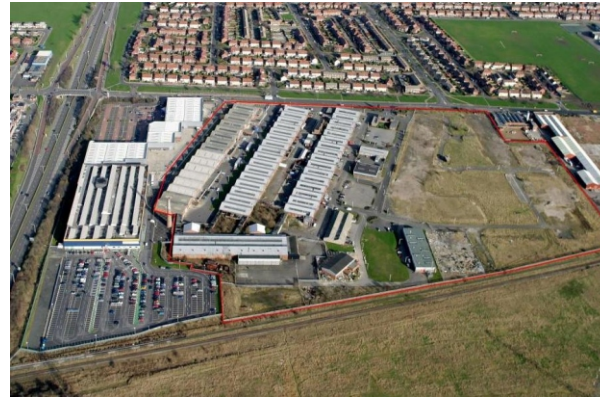
188 new homes providing a broad mix of family housing

Northern Trust Company Limited is proposing the large scale mixed use regeneration of the West Chirton (South) Industrial Estate. The illustrative layout shows the manner in which the existing derelict land and buildings can be brought back into beneficial use providing a mix of new accommodation for both businesses and families in the area.