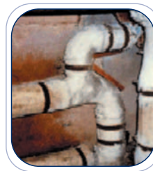
Asbestos Pipe Lagging

FOR FURTHER DETAILS AND A NO OBLIGATION QUOTATION CALL 01283 515485 OR VISIT WWW.ASBESTOS.IT