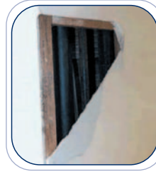
Damaged AIB Wall