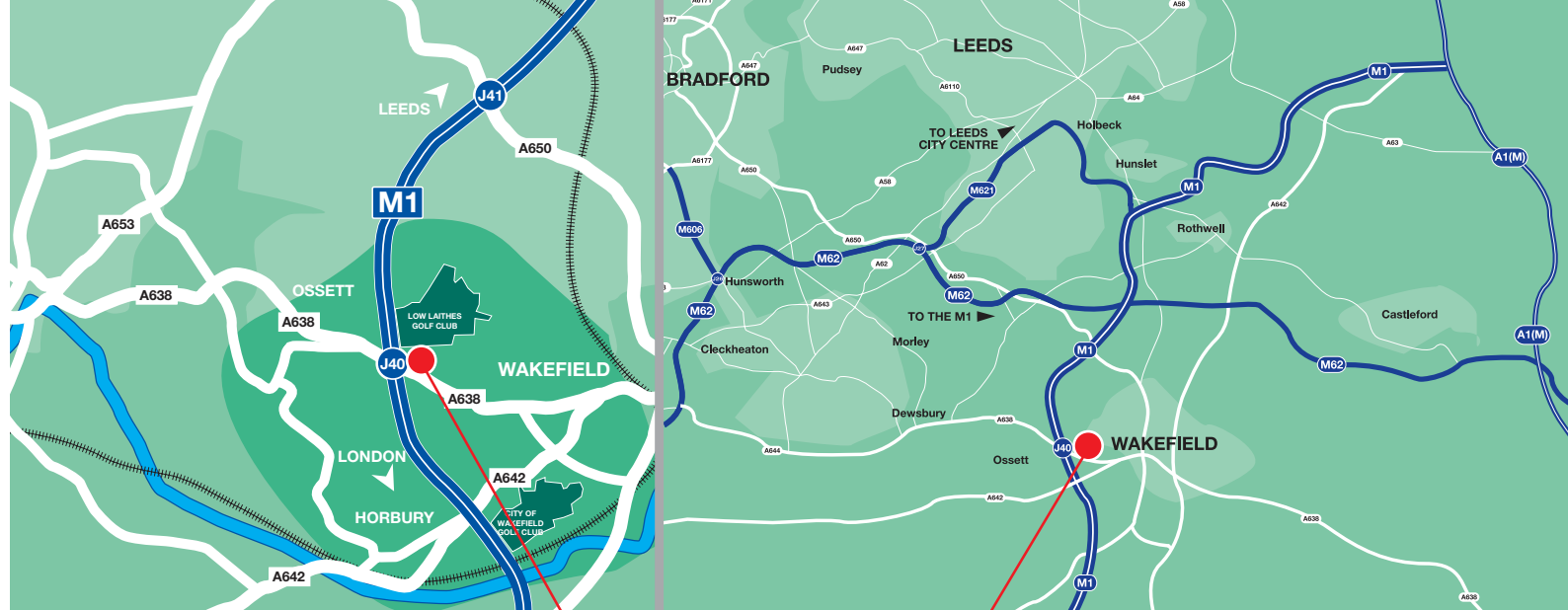
The Gateway, Silkwood Park, Wakefield