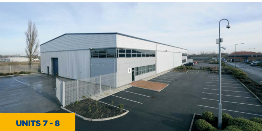
UNITS 7 - 8