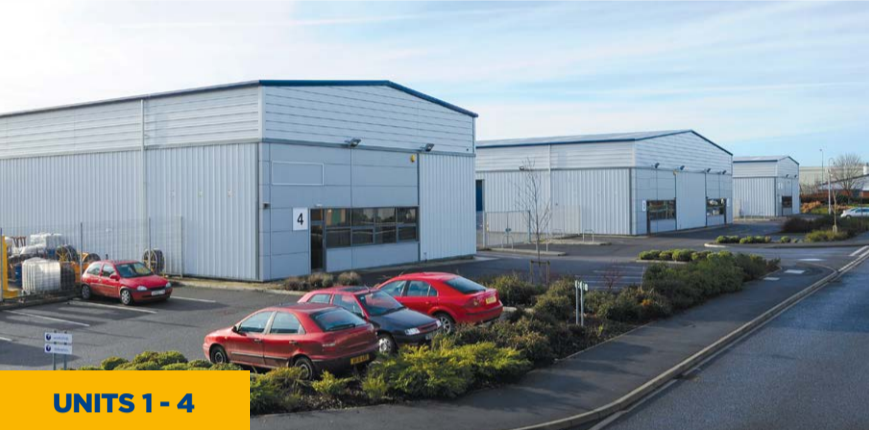
UNITS 1 - 4